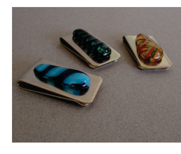
Money Clips 3/4" Nickel #GMC-S 1" Nickel #GMC-L